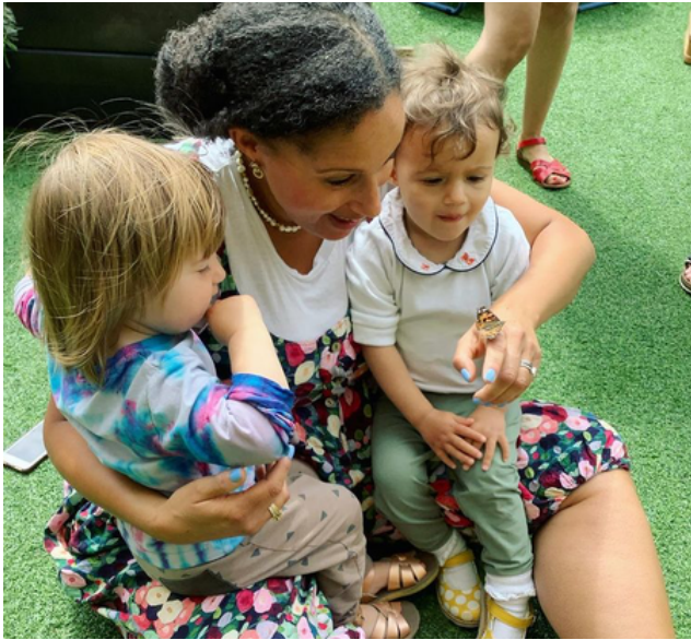
Wentworth children released their beautiful butterflies into the wild!