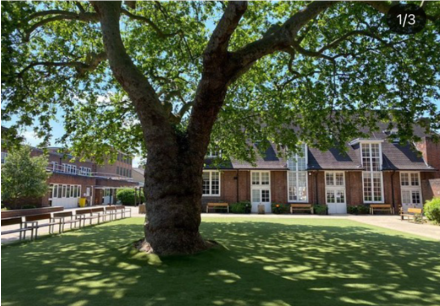
Clapton's recently refurbished courtyard shines in the sun